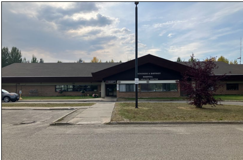
Mackenzie & District Hospital Upgrade