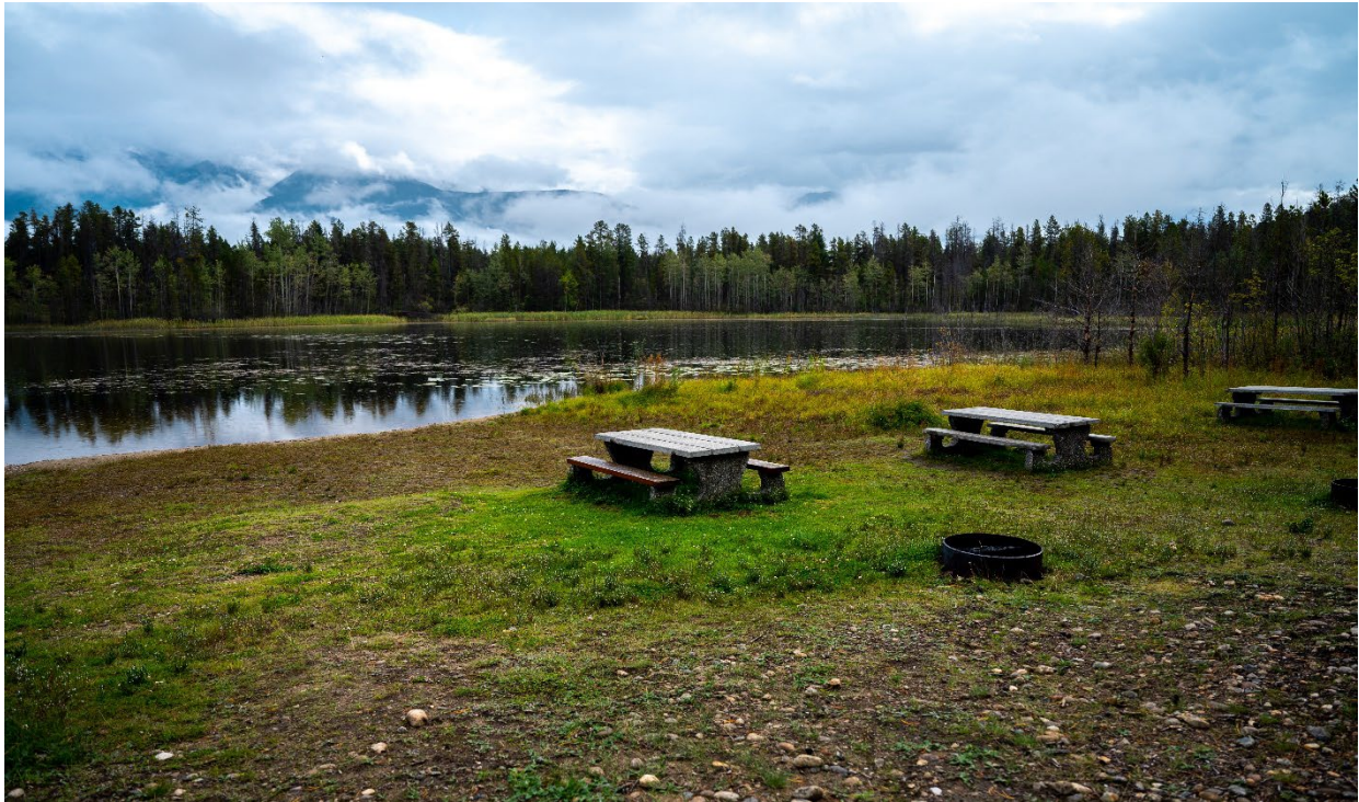
Cedarside Regional Park – located 3km south of Valemount on Little Cranberry Lake along the Yellowhead Highway