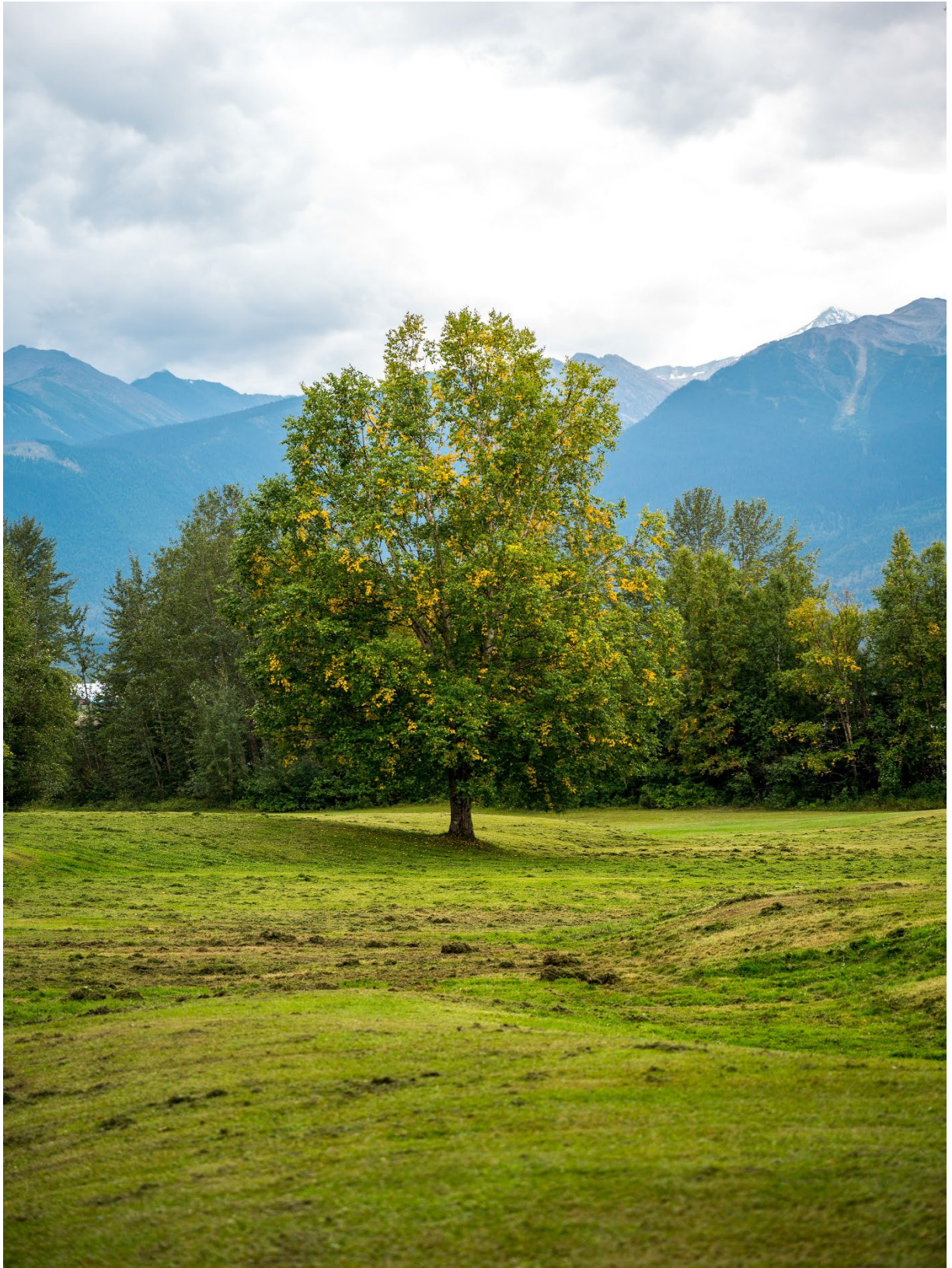
Koeneman Regional Park