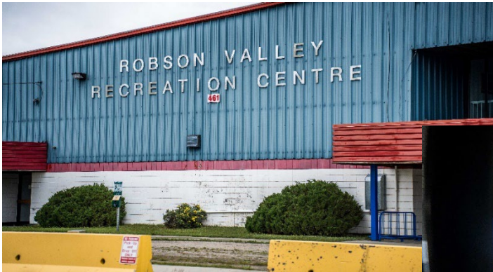
Robson Valley Recreation Centre located in McBride.