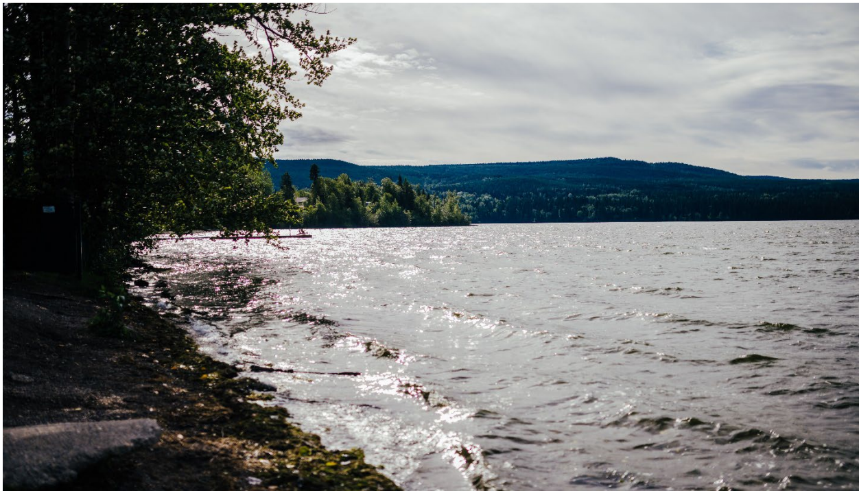
Tabor Lake – located 12km east of Prince George off of Highway 16